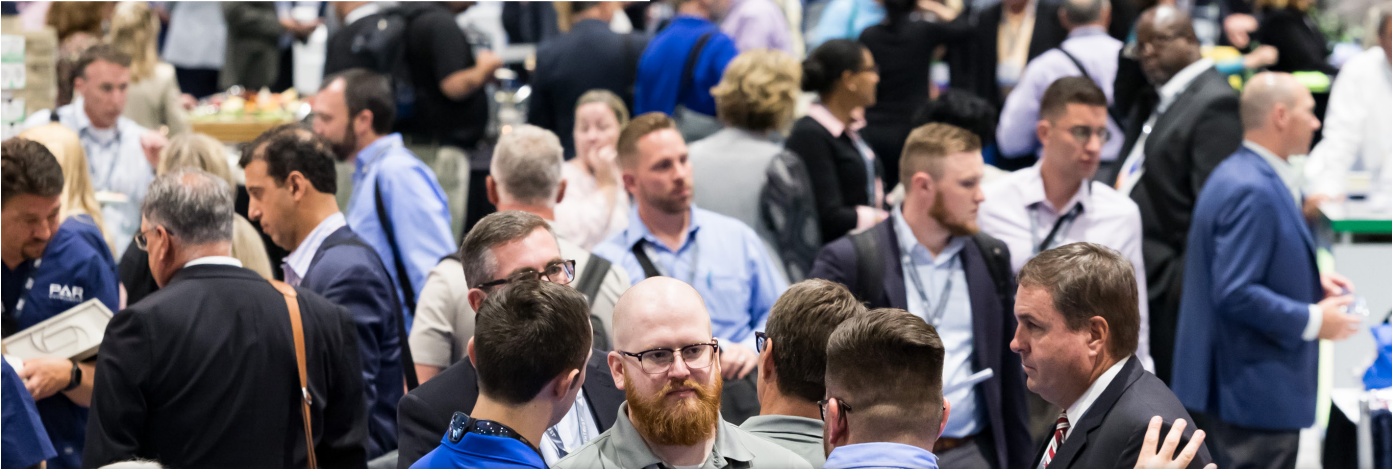
Exhibit at AHRMM20 Conference & Exhibition to Connect with Health Care Supply Chain Buyers

AHRMM20 Health Care Supply Chain Innovate. Engage. Connect.